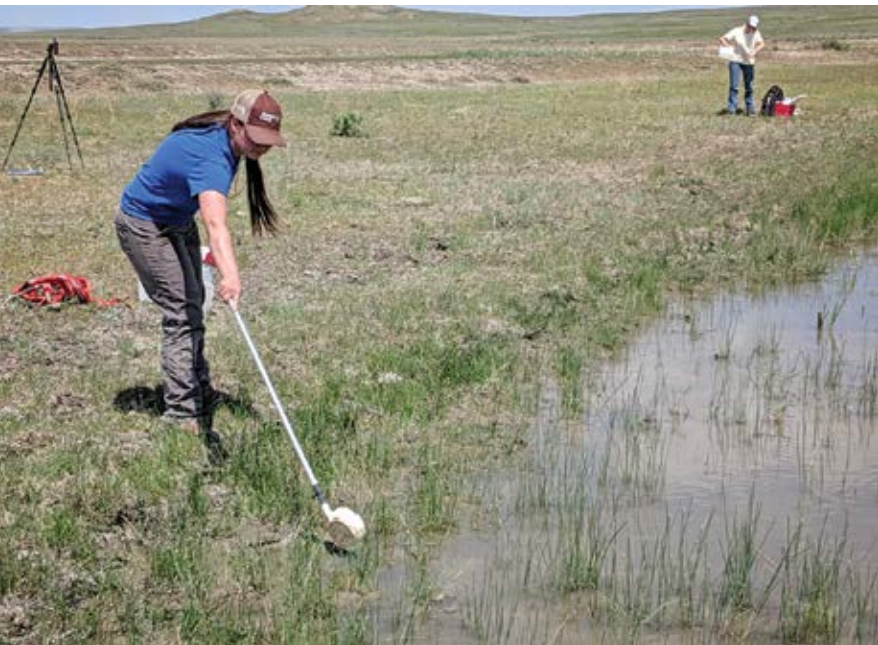
Early detection of zoonoses can save lives and capital. Field surveys by Carroll students for West Nile virus (WNV) in Montana provide early detection of the virus in mosquito populations and allow public health warnings to be issued in targeted local communities. The annual expense is less than the cost of treating one patient with neuroinvasive disease. Upper left, dipping for mosquito larvae to assess breeding habitat. Lower left, Carroll student and veterinary technician drawing blood from horses on the Fort Belknap Reservation to test for antibodies indicating exposure to WNV. Right, flood irrigation and stock ponds are landscape modifications that provide ideal breeding habitat for mosquito vectors.