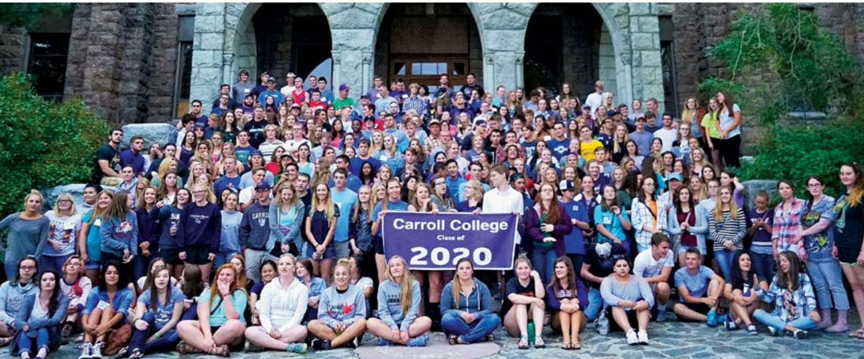
The class of 2020 on the steps of St. Charles during orientation of their freshman year, August 2016.

We know this year presented some unexpected challenges for our students in SURF so we reached out to them to get their perspectives. Please visit www.carroll.edu/surf2020 to read what our students had to say about "Digital SURF" and the value of research as part of their Carroll experience.