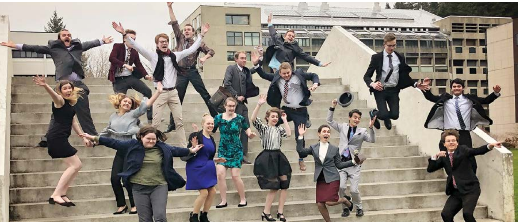
Talking Saints jump for joy after winning the Western Washington Invitational, January 2019.

“Teaching and coaching are about transforming lives.”