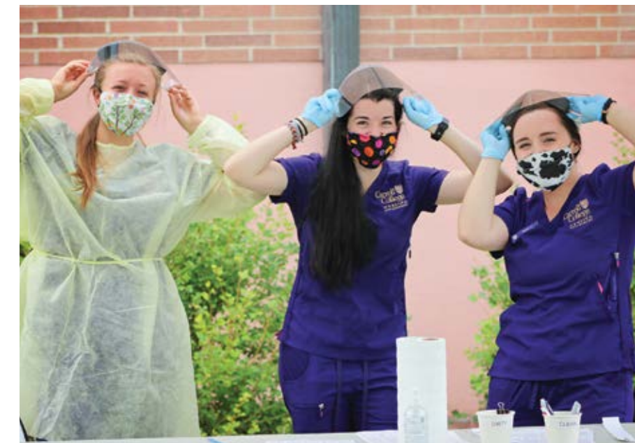
Carroll's nursing students assisted with the free on-campus COVID-19 testing provided for all students prior to the start of classes.