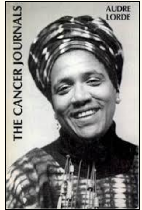
The Cancer Journals by Audre Lorde