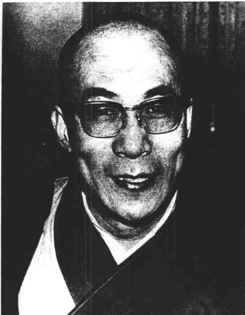
His Holiness The Dalai Lama

Figure 2. Tenzin Gyatso, the Fourteenth Dalai Lama of Tibet