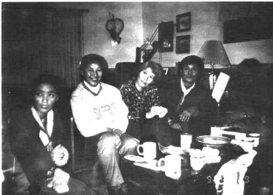
Figure 3. A group of Tibetan refugees in Missoula, Montana. November 1992