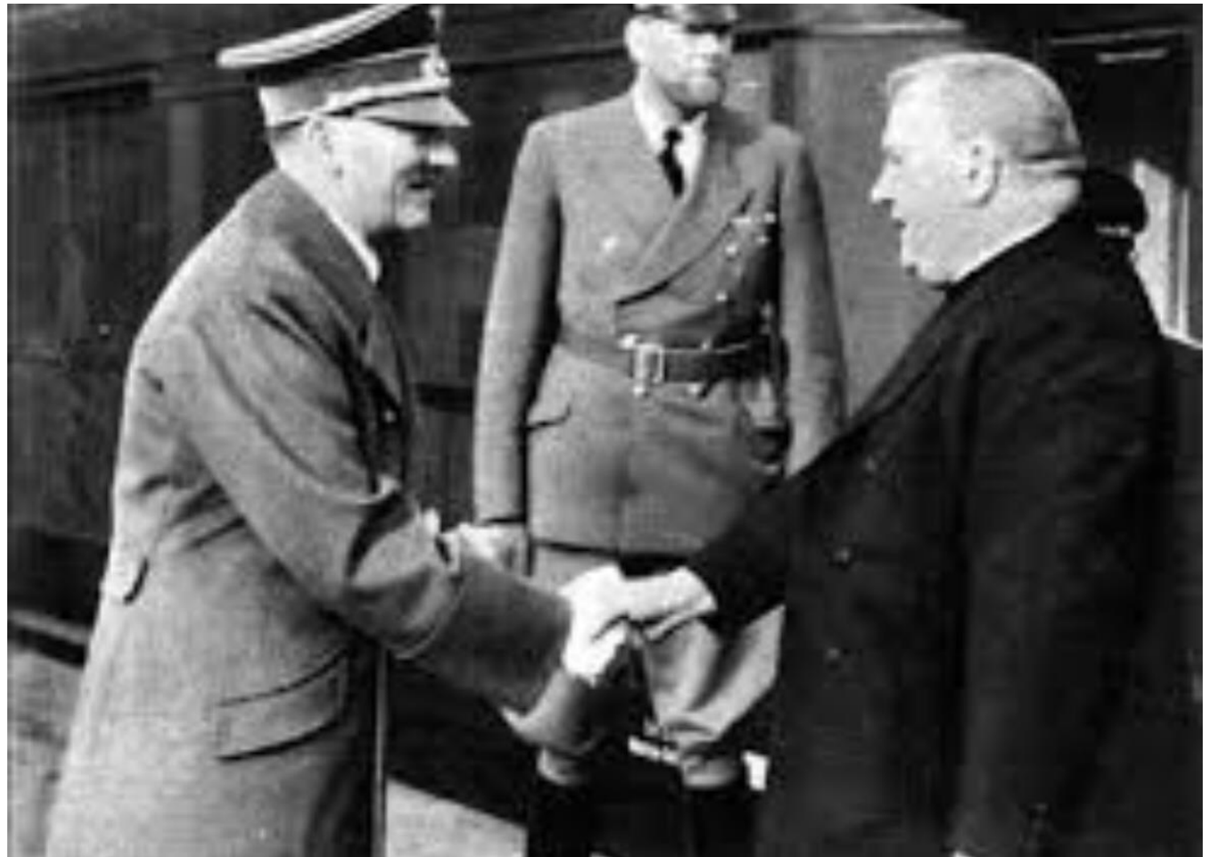
Slovak President and Catholic priest Josef Tiso meeting with Hitler