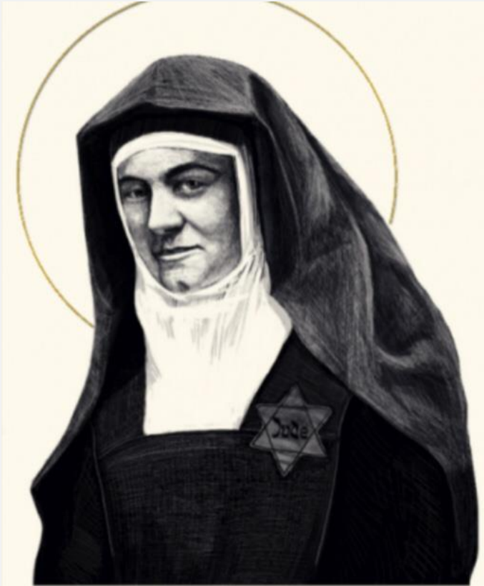
St. Edith Stein