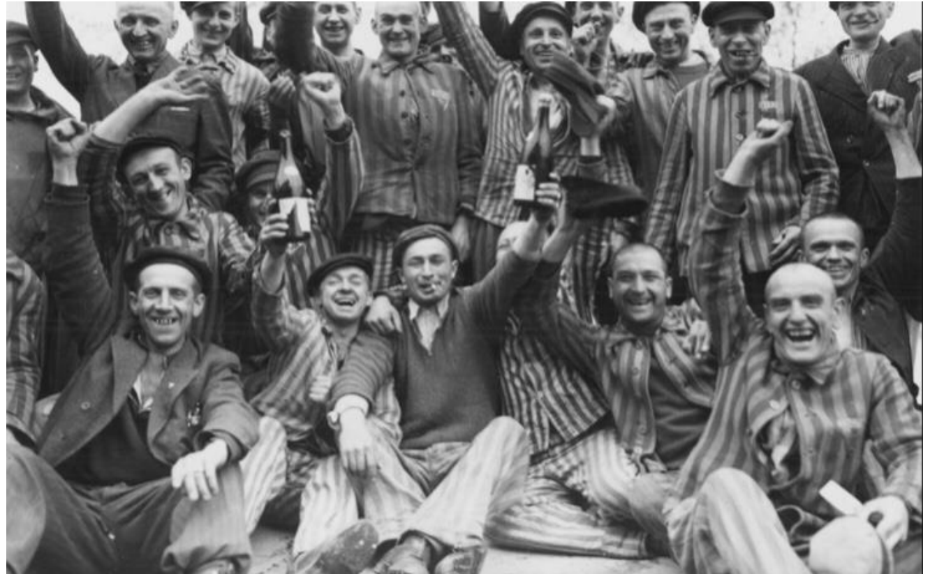
Polish priests after liberation from Dachau